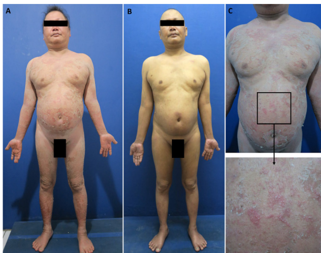
(A). before treatment, (B). after treatment, (C). pustular lesions developed over abdomen.