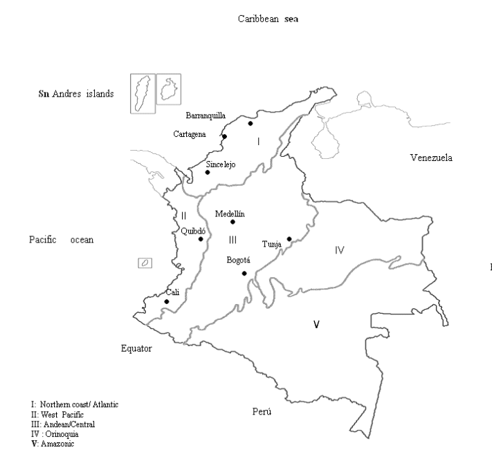
Figure 1. Natural Regions of Colombia: Continental (Northern coast / Atlantic, Andean/Central, West Pacific, Orinoquia and Amazonic) and insular regions (Atlantic and Pacific oceans). Adapted from http://www.memo.com.co/fenonino/aprenda/geografia/ regiones.html, accessed April 24, 2008.

a) The study included children younger than 5 years of age, with acute diarrhoea as established by the World Health Organization (WHO)