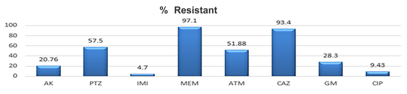
Figure 1. Antimicrobial resistance rates.

Distribution of antimicrobial resistance rates among P. aeruginosa clinical isolates used in this study AK; amikacin, PTZ; pipracillin-tazobactam, IMI; imipenem, MEM; meropenem, ATM; aztronam, CAZ; ceftazidime, GM; gentamicin; CIP; ciprofloxacin.