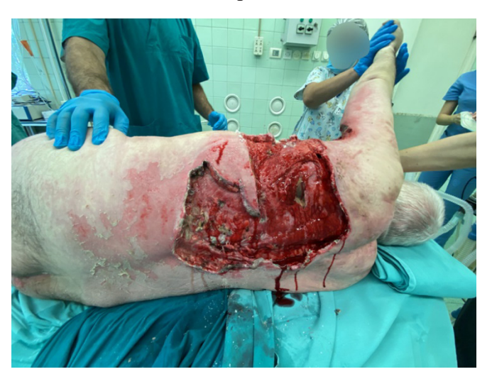
Figure 3. After several debridements. Advancement of necrosis and infection in the surrounding tissues.

in Table 1, in most cases, the NF complication arose in the first month following the initiation of treatment. Doses of oral corticosteroids reported in Table 1 varied from 30-100 mg daily, given as a monotherapy or combined with other immunomodulatory agents (IMA). Other patients were treated with topical corticosteroids, exclusively or combined with other IMA.